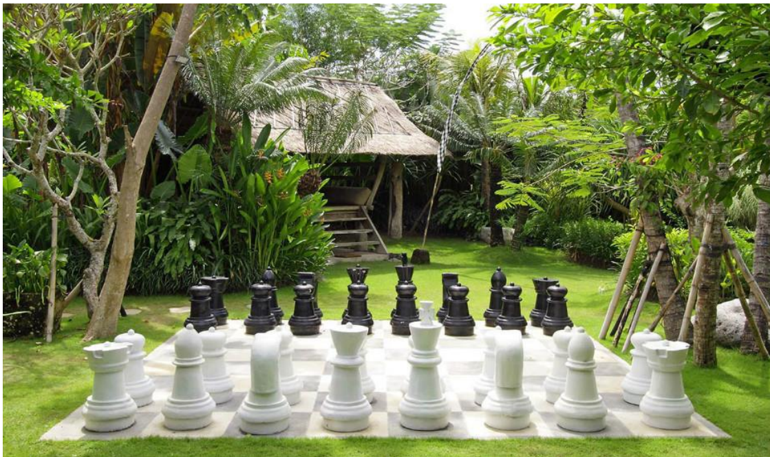
Dea Villas Estate

The Layar , Jalan Pangkung Sari No.10 X, Seminyak. p. +62 (0)361 733 262.