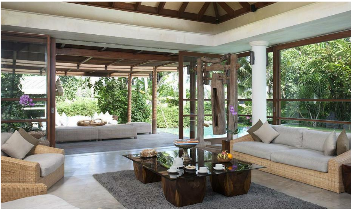
Dea Villas Estate