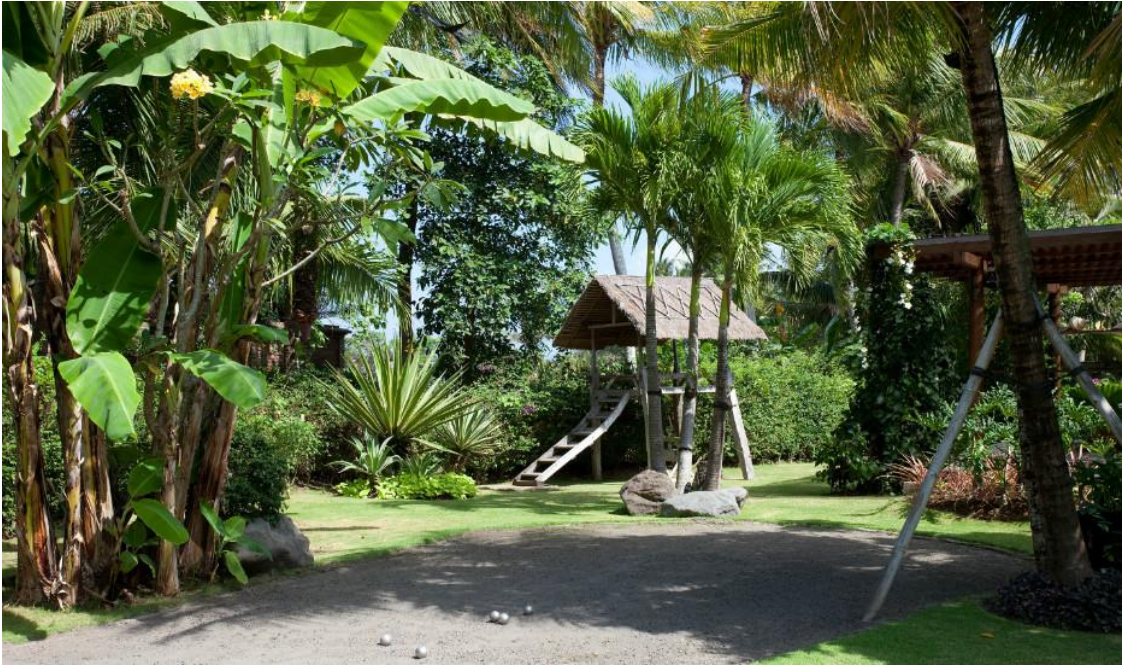
Dea Villas Estate